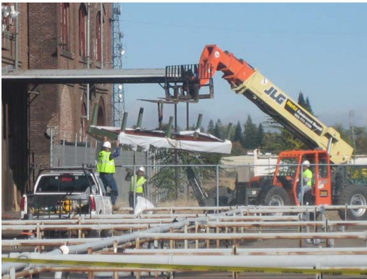
Photo above: Historic artifact removal from the Planing Mill. Artifacts will be salvaged and reused at The Railyards.