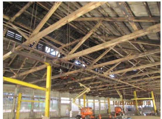
Photo above: Newly cleaned 145 year-old wood trusses in Blacksmith Shop.